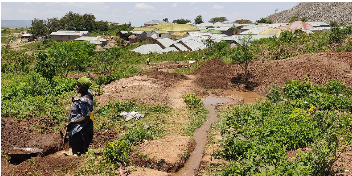
Artisanal mining, Nyabichune village, near the waste rock pile of Nyabirama pit at the North Mara mine

In what may be a new tactic, RAID also found that these police tortured Kurya residents in mine-related operations to, among other things, extract confessions that they had trespassed onto the mine or been involved in theft from the mine, or force them to identify others allegedly involved in such activities. In at least two instances, RAID found indications that mine personnel may have been aware of the torture.