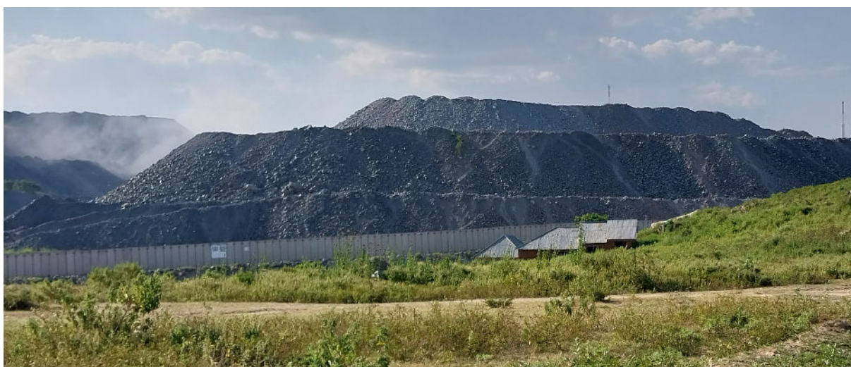
Homes in Nyabichune village against backdrop of waste rock pile by North Mara mine’s Nyabirama pit, where Kurya residents say they face ongoing pollution of dust from the mine