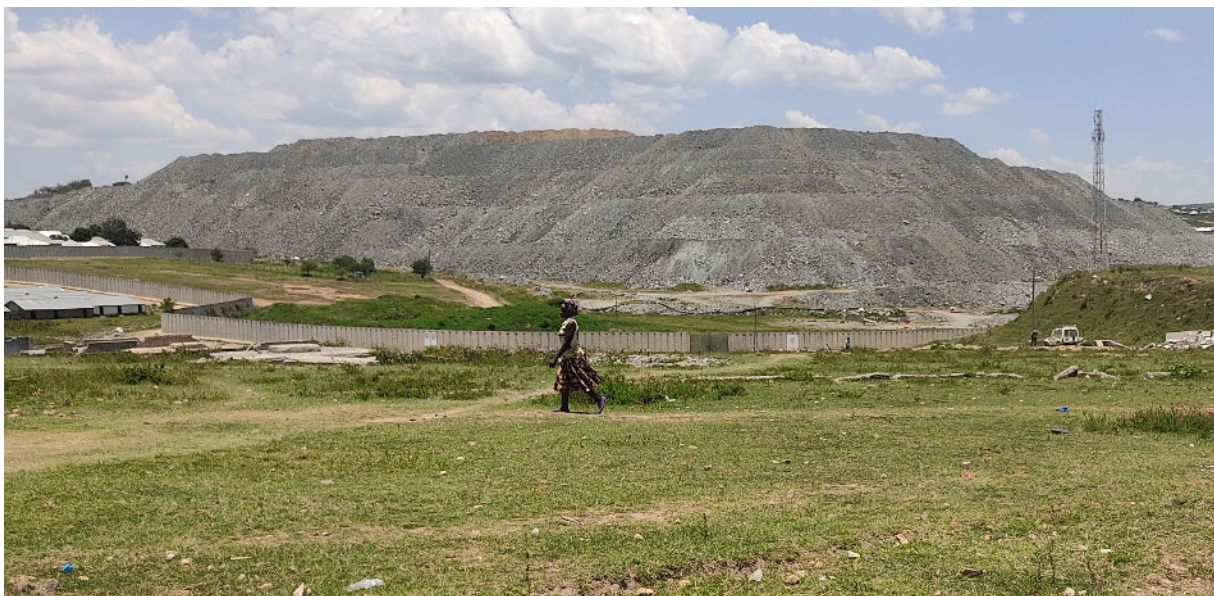
Waste rock from Barrick's North Mara mine forms the backdrop to daily life

These latest incidents bring the reported death toll at the North Mara mine to at least 77 and 304 wounded by police responsible for mine security, most of which occurred after Barrick acquired the mine in 2006. The rising number of killings and assaults ranks Barrick's North Mara mine as one of the deadliest industrial mines in Africa in terms of security-related violence.