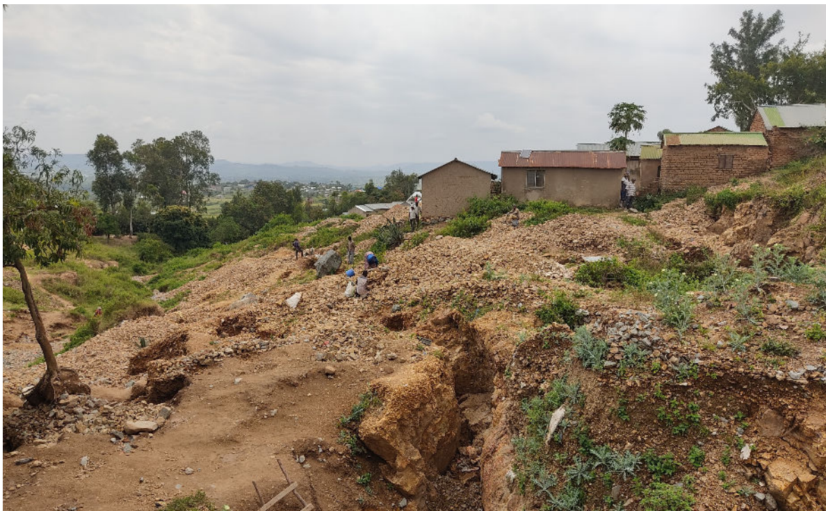
Artisanal mining, often a joint venture amongst Kurya community members, in Nyabichune village by the North Mara mine

The taking of land without compensation makes people poor, and when people become poor, they become hungry, literally hungry, and they become desperate, and this is why ‘intruders’ keep going [to the mine] and won’t stop. When people are hungry, they need to feed themselves and so they revert to intruding to try to ensure that they can eat.”