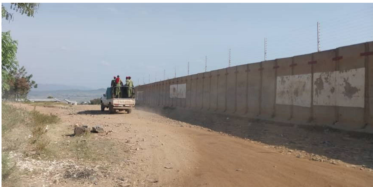
Mine vehicle used by police, with police officers in the back, along the North Mara mine wall at Nyabirama pit

As a Kurya man from one of the surrounding villages explained to RAID, “[n]ow, it is all about the CRT. When something happens, the CRT goes there. When there is a certain issue, it is the CRT.” Another separately confirmed to RAID that “[t]he CRT are much more involved now in security,” and a third told RAID that now “the CRT is the one that the white man prioritises”. All of these interviews occurred in 2022.