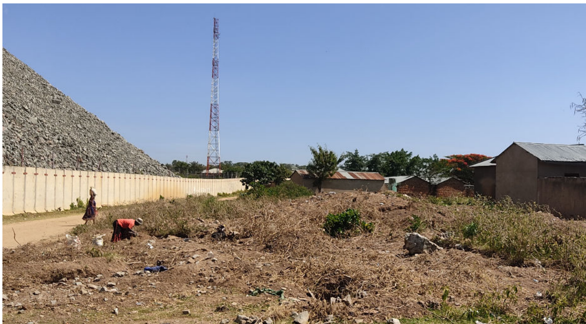
North Mara mine surveillance tower with CCTV cameras rises above Nyabikondo village by the Nyabirama pit, as women search for gold-bearing material below

At one point during this episode, while inside the mine walls, the vehicle stopped and Mhere was made to get up so that people wearing mine uniforms could inspect him.