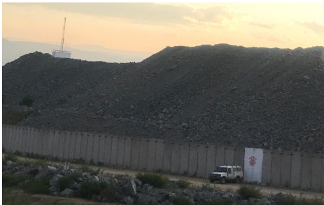
Mine vehicle used by police deployed at Barrick’s North Mara gold mine

Former security personnel confirmed to RAID that people entering the mine were not known to bring firearms, but that some caused injuries, including with stones and pangas (a machete-like agricultural tool). In their view, it was thus particularly important that the mine’s internal security personnel have “soft options”, such as foam baton rounds, in order to be able to respond appropriately. Thus equipped, they said, involvement of the police, who would often use disproportionate force, could be limited. As noted above, Barrick removed these “soft options” from internal security after taking operational control.