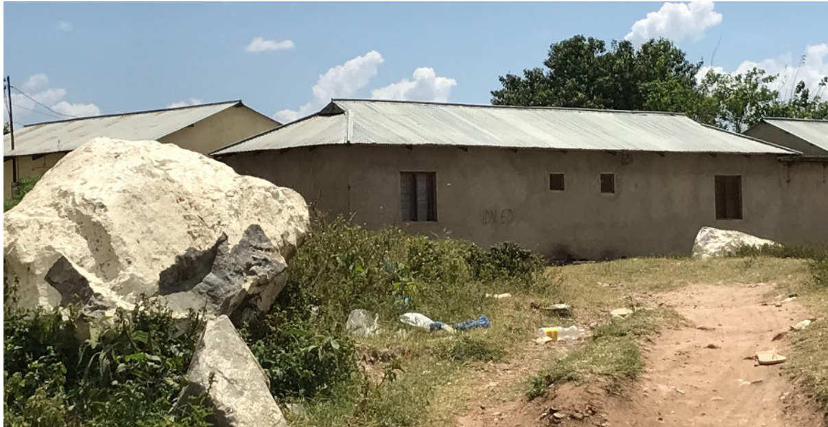
Large white boulders positioned next to homes in Nyangoto village mark the North Mara mine's property claims

In some areas, the mine wall is separated from homes by only a dirt road. According to local leaders interviewed by RAID, the mine has failed to provide for a 200-metre buffer zone between its perimeter and local homes, which they said was inconsistent with Tanzanian law.