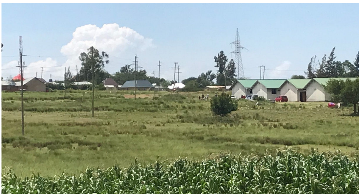
Green-roofed barracks provided by North Mara mine for mine-assigned police, Nyangoto village in the background

As noted above, under these Memoranda, the mine equips, feeds and accommodates in barracks built by the mine approximately 150 officers on an ongoing basis. It also pays each officer a daily sum in addition to their regular salary, making it a particularly lucrative posting. The mine further provides benefits to senior officers in the Mara region including monetary payments, vehicles, vehicle maintenance, fuel and accommodation within the mine.