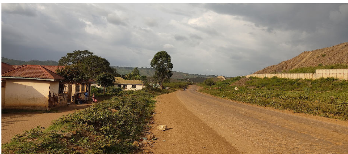
Public road divides Muruambe hamlet of Kewanja village and the North Mara mine's Gokona pit

In its response , Barrick did not address these concerns or threats, but instead attached what the company described as a "confirmation statement", dated 13 July 2022, and signed by 22 local leaders. The statement said that, "NMGM [North Mara Gold Mine] strongly observes and upholds principles of human rights and dignity" and that RAID's reports of human rights abuses were "false", and urged authorities to take action against RAID, referencing legislation that the Canadian government had identified as cause for concern.