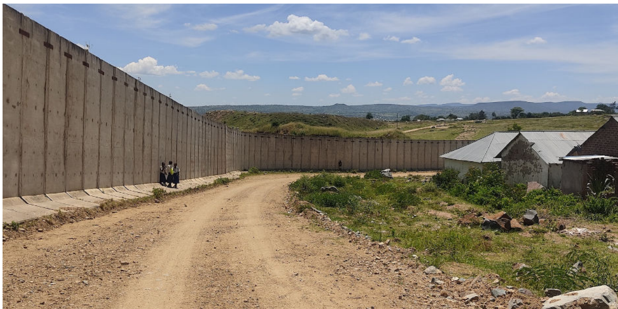
Children on their way home from school by the North Mara mine's Nyabirama pit wall, Nyabichune village