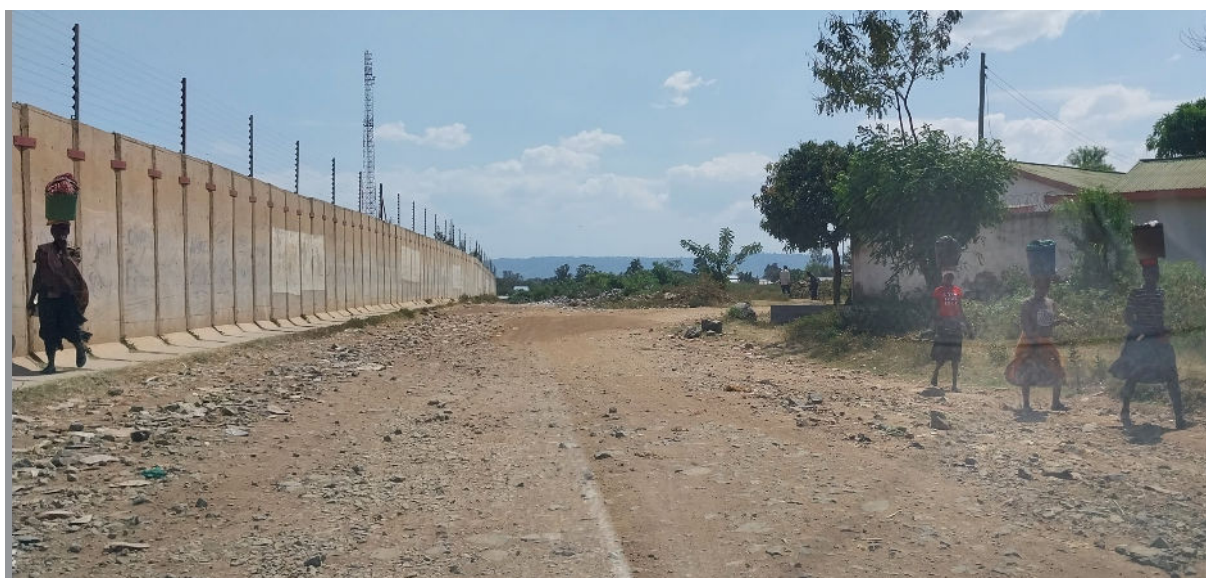
Daily life continues along the mine road separating the North Mara mine wall from homes in Nyabikondo village, near the site of one of the recent shootings