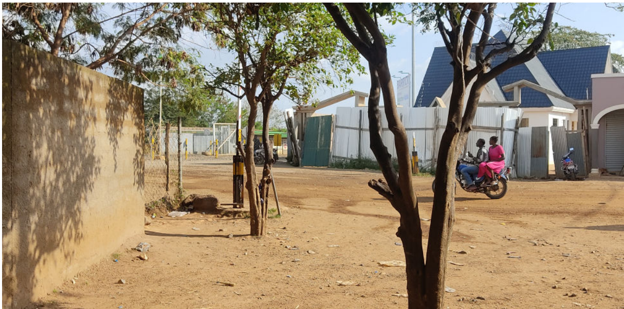
Motorcycle approaches crossing with North Mara mine road in Nyangoto village

But members of the mine's internal security team and police officers interviewed by RAID say the police assigned to the mine form part of the mine's security structure. They say the police are deployed to specific areas around the mine site, that they are present in the mine's security control room, and that they use the same radio frequency as the mine's internal security team. A senior police commissioner confirmed to RAID in May 2022 that police engaged by the mine provide their services to the mine exclusively and not to the community at large.