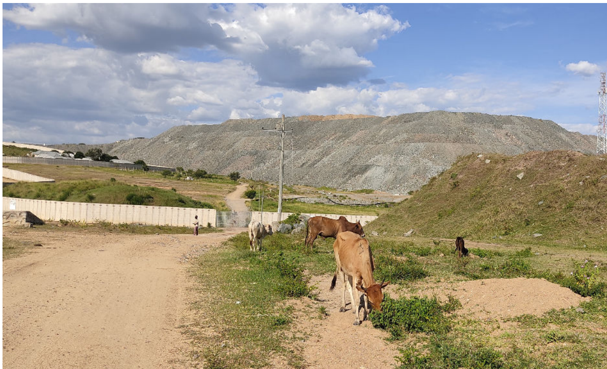
Areas for Kurya residents to graze cattle, seen here in Nyabichune village in front of waste rock by the North Mara mine's Nyabirama pit, have shrunk as the mine has expanded

Those who did not accept faced the risk of being forcibly evicted. According to a detailed complaint in 2003 by the Lawyer's Environmental Action Team (LEAT) in Tanzania to the state's Commission for Human Rights and Good Governance, many such evictions were carried out by members of the Tanzanian Police Force to clear the way for the mine's development. A Kurya elder who was an elected official at the time told RAID: